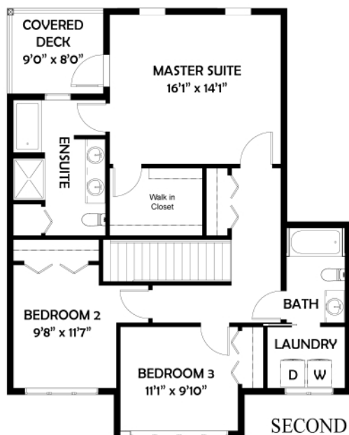
SECOND FLOOR 1,016sqf